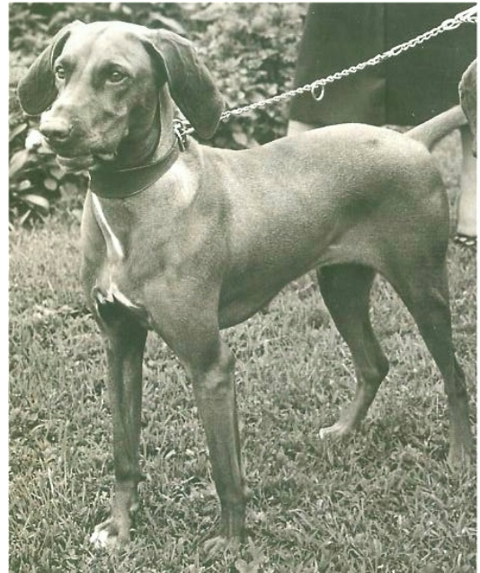
Figure 6 Sari first Vizsla Imp. to USA

Pictures in Figure 5, 3 and 4(6) – courtesy of Diana Boggs and http://vizslavizsmithsonian.com/