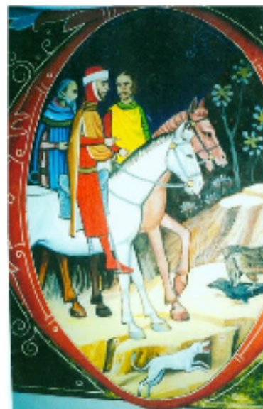
Figure 2 From Vizslasmithsonian by Diana Boggs