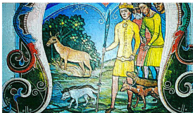
Figure 3 From Marion Coffman

Some of the original breeds in the background of the Vizsla are thought to have come from the Asian (Turkish) greyhound and Buffons, Turkish Yellow hounds, some sources stated that greyhounds of sloughi type and also a Transylvanian hound dog may have been in the ancestry tree of the Vizsla or Hungarian Pointer as it is known in Hungary and most of Europe now. The breed's name in Europe Magyar Vizsla. Hounds were used in the Hungarian region for hunting in the days of the Arpad dynasty from 11th to 14th century and it was most likely the Yellow Turkish Hound and variations of hounds were used to hunt with falcons. Magyar Pointer or Hungarian Vizsla as we know it today did not exist at that time in all probability, nor we can say for certain that