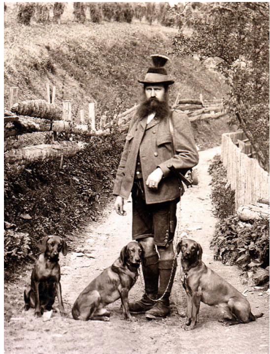
Figure 4 (6) Hung. Nimrod