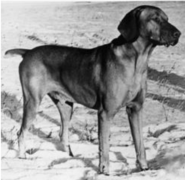
Figure 5 Agres z Povazia First Vizsla Imp to Canada

That period is another distinct chapter in the history of the Vizsla breed and deserves to be written about in detail. The first standard of the breed was published in 1928. In 1935, Federation Cynologique Internationale (FCI) recognized Vizsla as a breed and in 1938 first Vizsla came to America. Vizsla came to Canada few years before USA and the Canadian Vizsla history is described here .